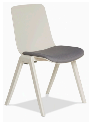
RES175 Belief Chair - grey seat padding