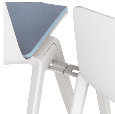
Built in linking device